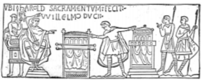
Bayeux Tapestry: Harold swearing on the relics. "Harold Sacramentum Fecit Willelmo Duci"

Place crushed hulls into a pot, and fill with water. After about a half hour, the water will be brown/ black. You can strain the liquid from the hulls or just add the wool/yarn. Simmer for about a half hour or until the shade of brown you wish is reached. Adding iron or premordanting with iron will create black hues.