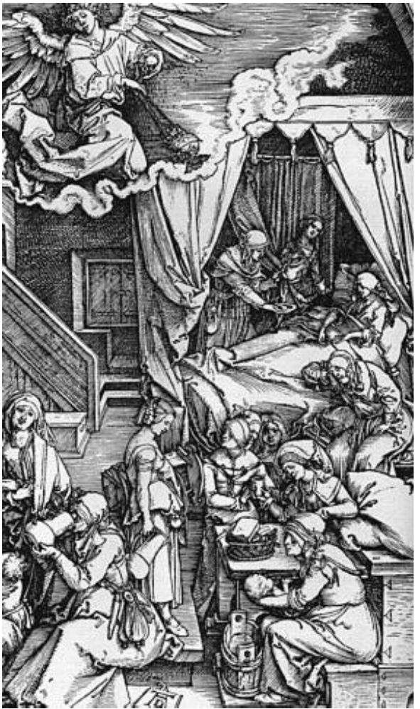
Albrecht Durer, The Birth of the Virgin (detail)

Dharma Trading PO Box 150916 San Rafael, CA 94915 (800) 542-5227 (USA and Canada) (415) 456-7657 (Elsewhere) http://www.dharmatrading.com/index.html