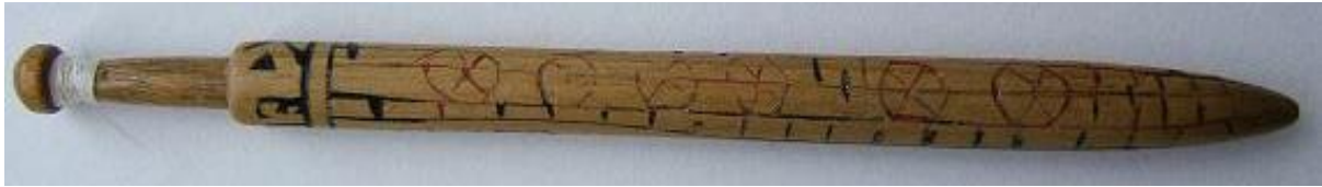
One of the three original bobbins.

Oh, thought I, a series of circles alongside a ladder! That might fit into one of my artistic genres as I have quite a collection of simple or perhaps crude artistic carved bobbins. But I looked closer and decided that there was more to these pictures than a set of circles.