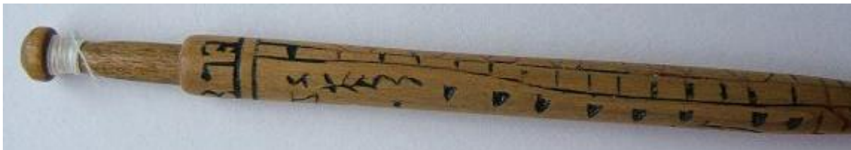
The second original picture

Oh, thought I, a series of circles alongside a ladder! That might fit into one of my artistic genres as I have quite a collection of simple or perhaps crude artistic carved bobbins. But I looked closer and decided that there was more to these pictures than a set of circles.