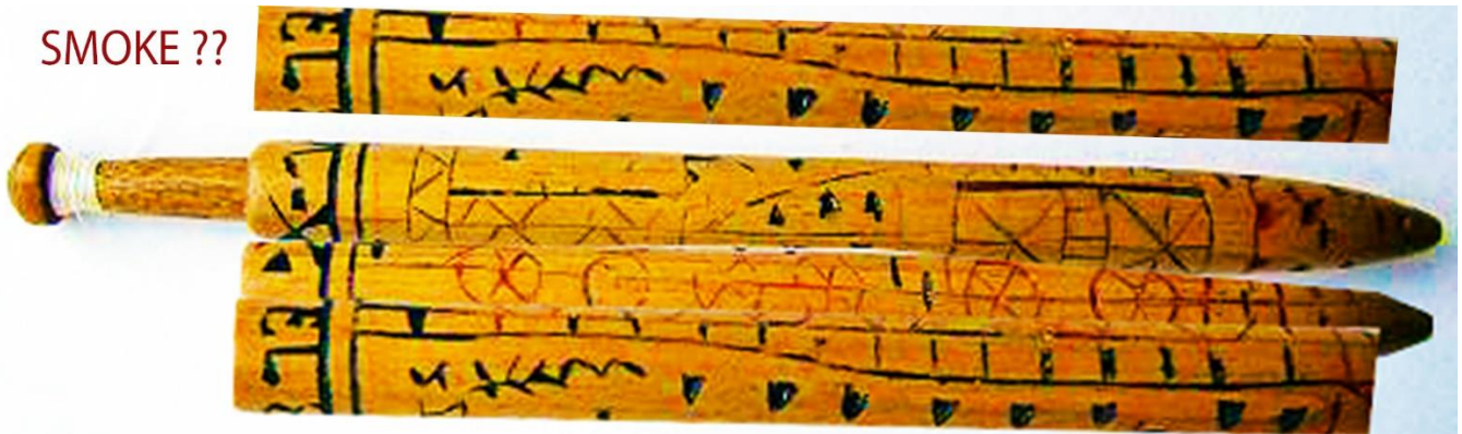
Possible railway train and carriage FILE ID = SP