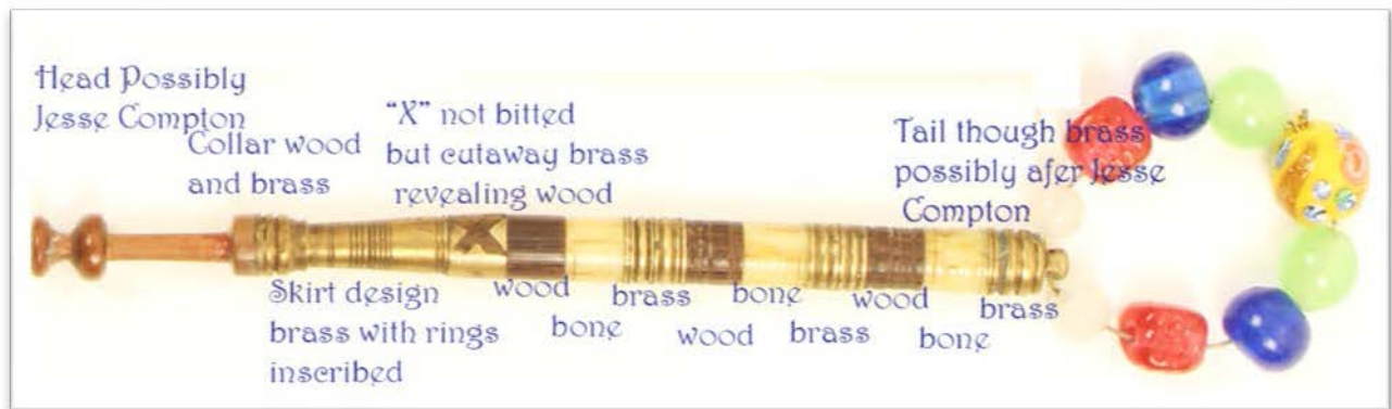
Annotated Bobbin No.2.