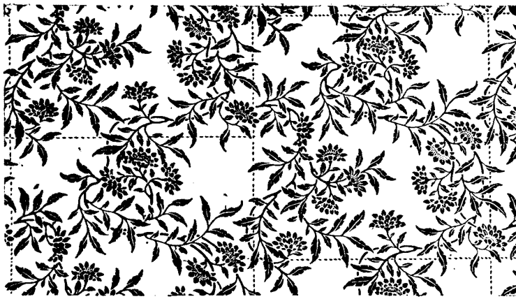
2. PREDETERMINED GAPS IN A PATTERN.

In a pattern in which patches of the ground are left bare, the gaps are by no means accidental. They are most