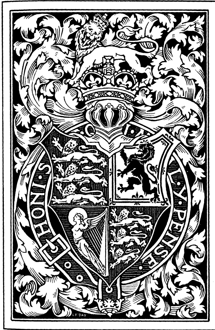
3. BALANCE OF ORNAMENT ENOUGH FOR A PANEL BUT NOT FOR A REPEATING PATTERN.