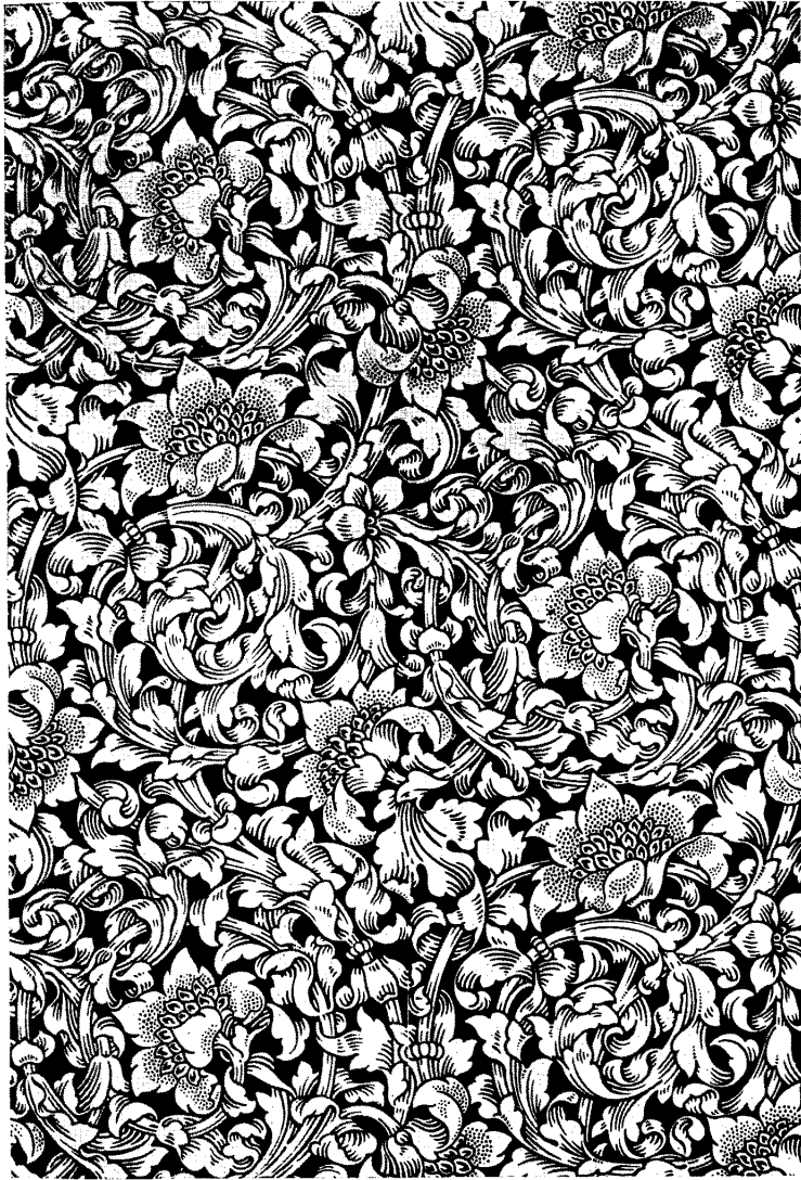
4. WALL PATTERN IN WHICH THE LINES OF THE SCROLL ARE QUITE EVENLY BALANCED.