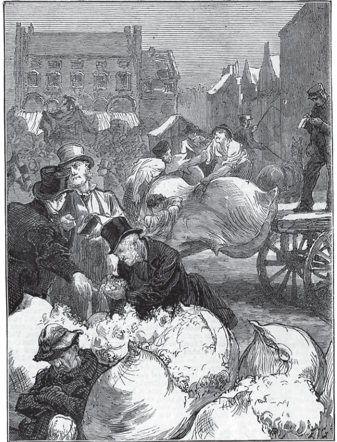
BUYING AND SELLING