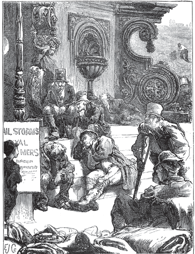
THE MARKET CROSS