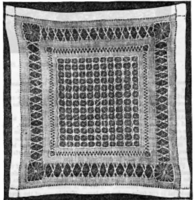
FIGURE No. 3.—FINGER-BOWL DOILY.