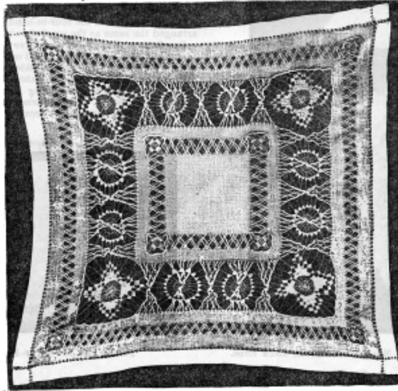
FIGURE No. 1.—DRAWN-WORK PLATE DOILY.

said of the doileys shown at figures Nos. 1 and 2 that their broad borders may be developed on strips of linen lawn and used as insertions in the making of baby gowns or of chemisettes, waists or any garment or article requiring such a decoration.