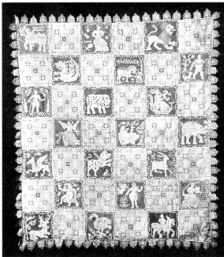
PUNTO TRAFORA RETICELLA BORDER