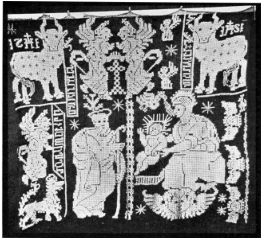
KNOTTED NET GERMANY, 1500