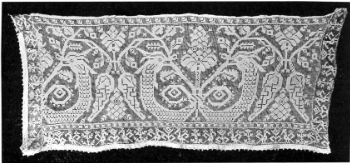
PUNTO A MAGLIA QUADRATA ITALY, EARLY SIXTEENTH CENTURY

From this time on Reticella grew more and more popular, and furnished alike borders for priests' robes and for fashionable garments. It trimmed capes, caps, collars and cuffs, as shown in pictures of people wearing lace-trimmed garments, by Holbein, Van Dyke and other early painters, which hang above these show cases, to display the vogue in those days of this new lace.