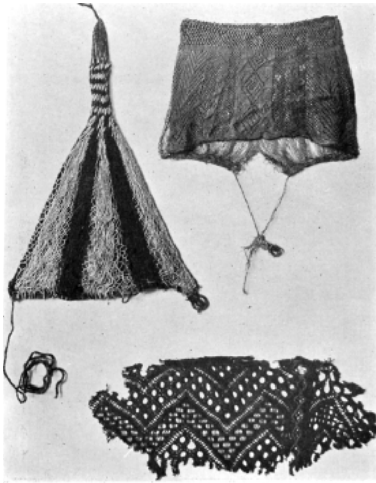
COPTIC, EGYPTIAN TOMBS THIRD TO SEVENTH CENTURIES A.D.