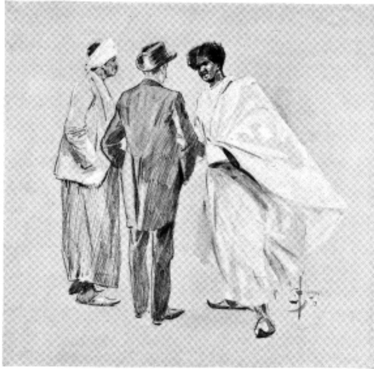
Trying to Get the Better of the Native.

goes there with intent to thoroughly "do it" is laying up for himself anguish of mind and the complete annihilation of his muscular and nervous force. It is far too big for any question of conscience to be allowed to enter in. Its bigness is beyond description. No words or pictures can tell the story of its size. Experience alone can teach it. You must go there day after day, to return at night with tired eyes and aching limbs, and with the bitter and ever increasing knowledge that as an exhibition you can never grasp it. Where other exhibitions have been satisfied with a display of an hundred cubic feet of any special article, Chicago must have