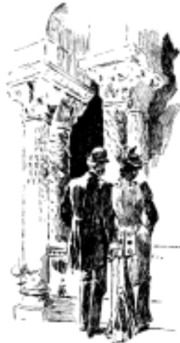
A Bride and Groom.

An unlooked-for feature of the exhibition is the profusion of newly married couples. Whether all this individual ecstasy adds gayety or mournfulness to the Fair depends, of course, entirely upon the point of view from which the victims are regarded. It is evident that many happy grooms have considered this a chance to kill two birds with one stone, and, as far as one can judge results from outward appearances, there is no question as to the practical working of the scheme. The happy couple find themselves in a sort of fairy land, wandering about among countless strangers, whose very numbers seem to lend security and to harden the over-sensitive soul. The crowd also seems to create a feeling of isolation which the innermost recesses of a