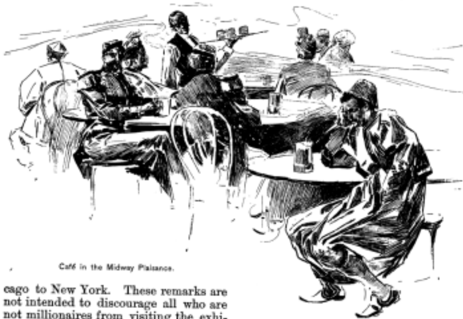
Café in the Midway Palace.

cago to New York. These remarks are not intended to discourage all who are not millionaires from visiting the exhibition. It can be done with less money. The writer has himself accomplished it. In fact, it is only fair to say that many of the stories of extortion which have come from the White City are much exaggerated. The most successful brigands are in the city of Chicago, and not at the Fair.