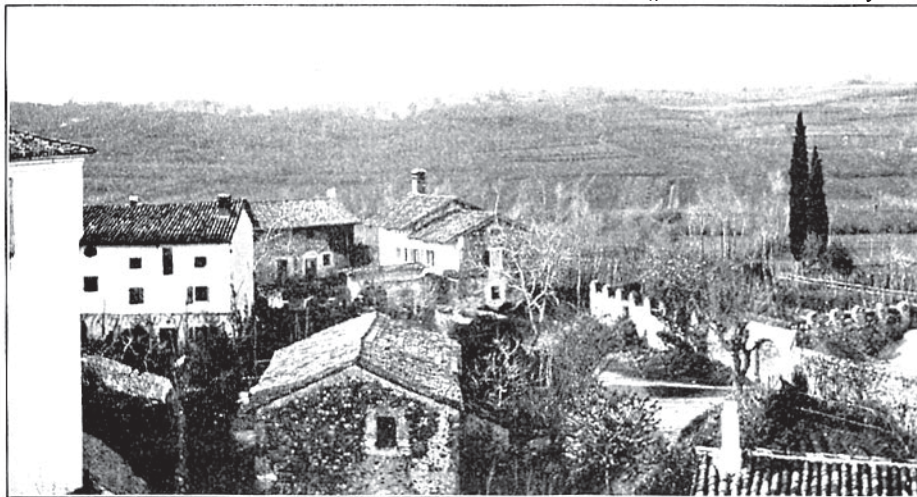
VIEW OVER THE PLAIN FROM SANTA MARGHERITA

The sale of laces shows that middlemen managed to make large profits between the price paid to the girls for their product and that paid by the merchant for it. To do away with this, thus benefiting both producer and consumer, the founder of the lace schools started a society under the name "Le Industrie Femminili Italiane," a national co-operative association for women's arts and crafts, a central clearing-house. In the few years