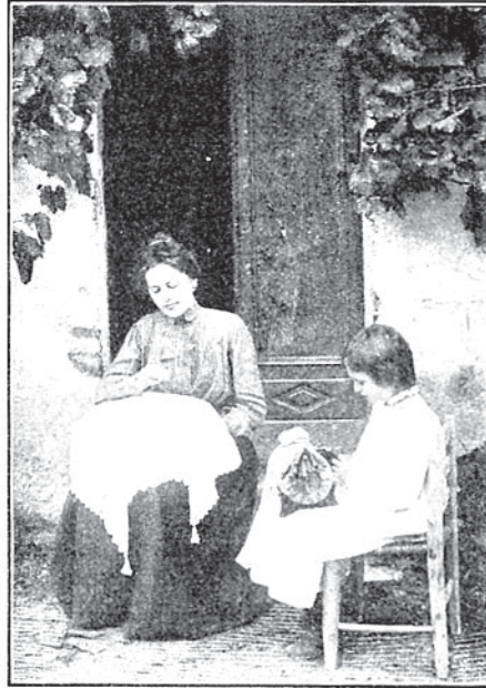
THE LAST TOUCHES AND THE FIRST STITCHES

Finally, the lace school is a school of morals. Prize-day is the great day of the year. Here in the Friuli, for forty miles around, the children gather in the park at Brazzà, not far away from us. The spirit underlying the whole endeavor is shown in the fact that certain moral qualities are rewarded before mere proficiency in lace-making is noticed. Thus, the first prize—a golden three-leafed clover on a gold chain—is given for the three virtues of self-control, order, and truthfulness.