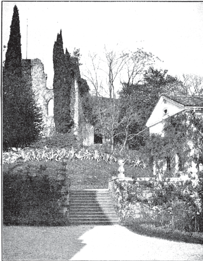
THE RUINED CASTLE OF BRAZZÀ

But the lace school has been doubly useful. It has taught the peasants throughout Italy that the coin of the