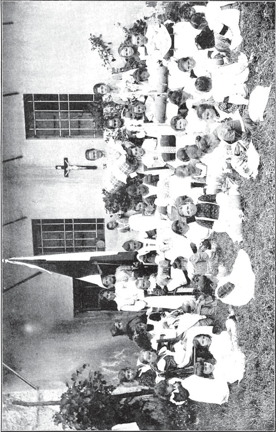
THE LACE SCHOOL AT SAN VITO