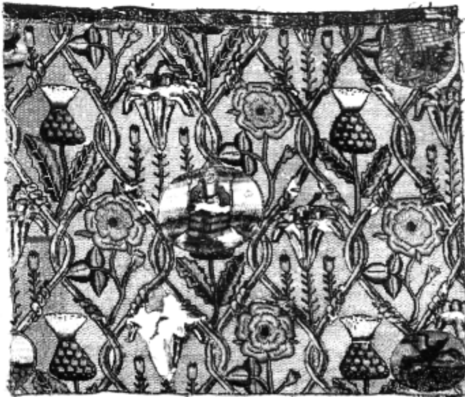
Figure 3. Square panel of canvas work, silk with some gold and silver thread, bearing the cipher of Mary, Queen of Scots. Hardwick Hall.