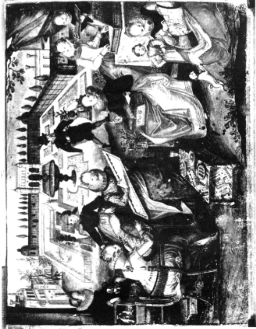
Figure 2. Page from the autograph album of Gervasius Fabricius of Salzburg, 1613. Add. MS. 17025, f. 50. British Museum.