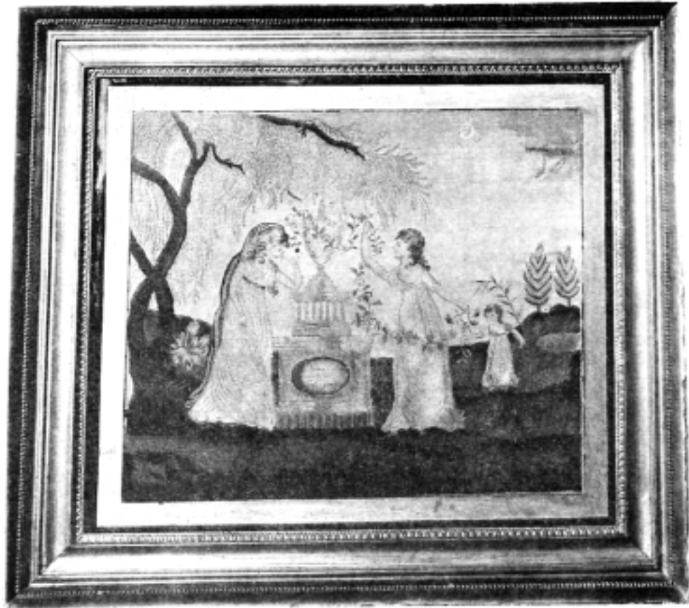
EMBROIDERED MEMORIAL PICTURE INSCRIBED: "IN MEMORY OF THE ILLUSTRIOUS WASHINGTON."