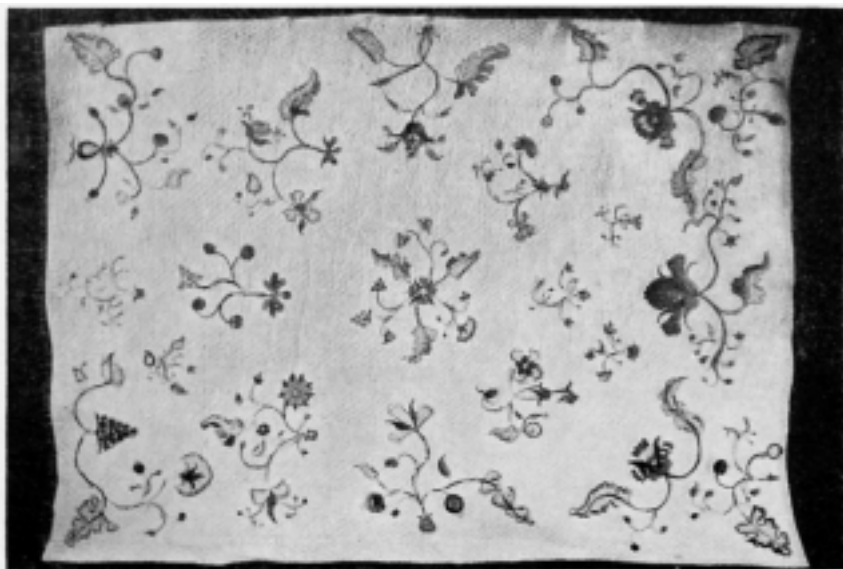
EMBROIDERY PRESERVED IN LIBRARY AT HARTFORD, VERMONT.

As we have noted that the stitches employed were the same for long periods, and also the fabrics for needlework, it is evident that in attempting to date pieces a knowledge of the history of design is of the greatest importance, and as a design was sometimes employed long after its proper period it is often difficult to place an exact date, but one thing should be noted—that no example is earlier than its latest characteristic.