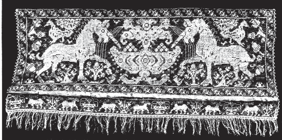
ITALIAN FILET, LATTER HALF OF SIXTEENTH CENTURY BROOKLYN MUSEUM COLLECTION