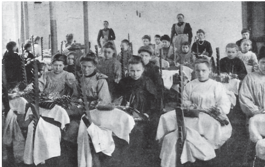
A CLASS IN LACE-MAKING AT PAPENVOORT

It is perhaps too soon to say, yet certain factors have already proclaimed themselves: first, that a new economic balance between producer and consumer is bound to assert itself. Certain elements are inalienably concerned in this fact. Full man-power would be appreciably diminished in countries that have hitherto been industrial feeders of world markets.