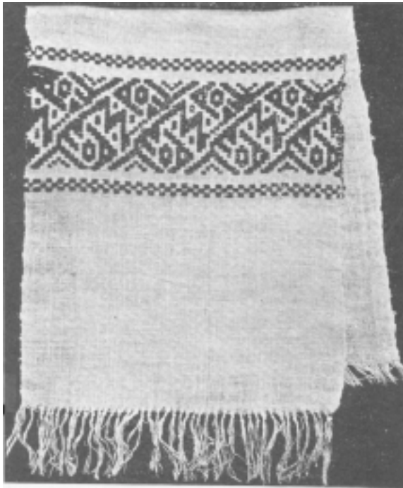
2. PERUVIAN BIRD MOTIVE SCANDINAVIAN STICK WEAVING

But the four-harness loom, when threaded to the simple 1-2-3-4 threading, gives an easy mechanism for such an effect as Miss Gundersen has attained, in all sorts of materials and for a