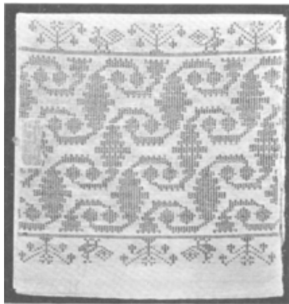
1. BROCADED BORDER ON LINEN TABLE RUN