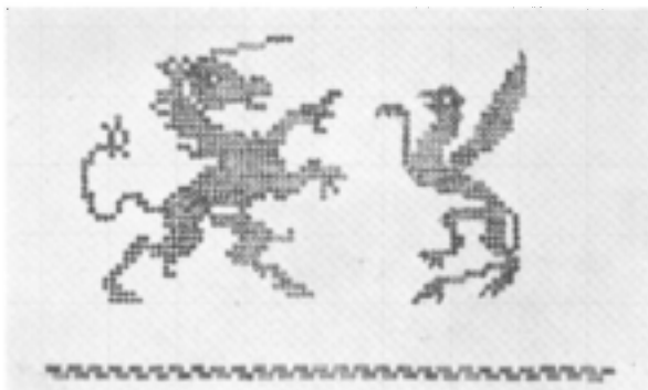
4. DESIGN ON SQUARED PAPER WHICH MAY BE USED AS "BROCADING" OR "GREEK" WEAVE

black, proceeding next with the background of grey; and then as we reached the point where the trailing end or "antenna" of the fish began, we should change our shed by changing our treadles from 1-3, 2-4 to 1-2, laying in our first color at the point of the design over two threads, letting the