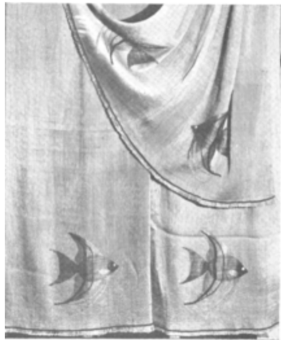
3. AN EFFECTIVE EXAMPLE OF EMBROIDERY WEAVING IN THE "GREEK" METHOD

If we were beginning to weave a replica of the fish in our illustration, we should make a drawing