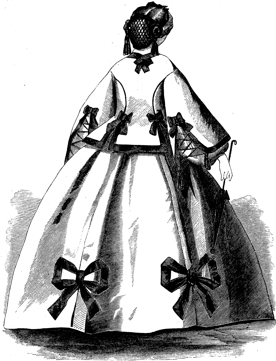
THE ZOUAVE MORNING ROBE.