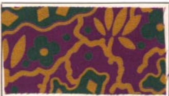
No. 7 Pad: 4% Azol Printing Violet RR extra Yellow: 10% Indanthren Yellow G double paste fine Green: 10% Indanthren Brilliant Green GG double paste