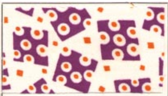
No. 5 Orange: 2% Azol Printing Orange R Violet: 2% Azol Printing Violet RR extra