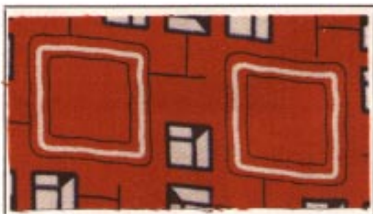
No. 6 Pad: 4% Azol Printing Orange R White: Rongalite C + Citrate Discharge Black: 6% Black for Outlines T