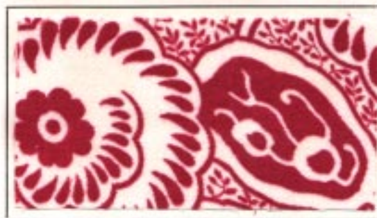
No. 2 3% Azol Printing Red R extra