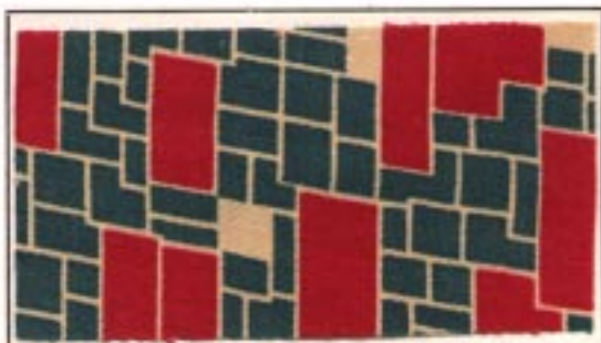
No. 8 Red: 10% Naphtol AS-TR/Fast Red Salt TR Blue: 2% New Gallophenine 5G