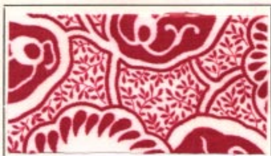
No. 1 3% Azol Printing Red BB extra