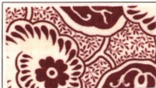
No. 4 3% Azol Printing Brown 3 RL