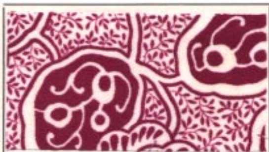
No. 3 3% Azol Printing Bordeaux B extra